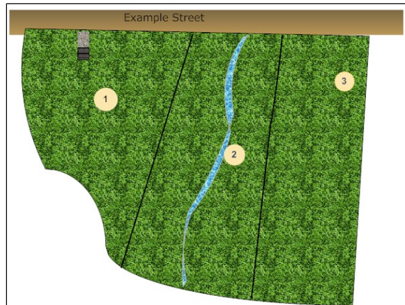
Example 1: Conventional Subdivision: A 160-acre parcel subdivided using the underlying Forest Conservation District where no lot is smaller than 50 acres.