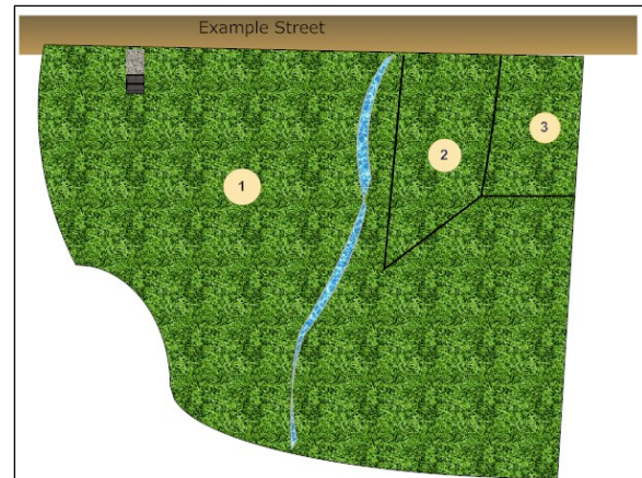
Example 2: Lot Size Averaging Subdivision: A 160-acre parcel subdivided using lot-size-averaging allows the original landowner to retain the vast majority of his/her property, while subdividing the same number of properties as the underlying Forest Conservation District would allow in a conventional subdivision.